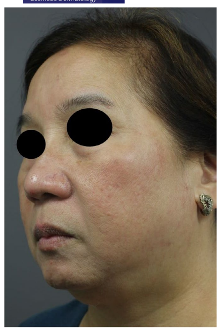
FIGURE 2 Patient #2: before and 4 months after a single procedure